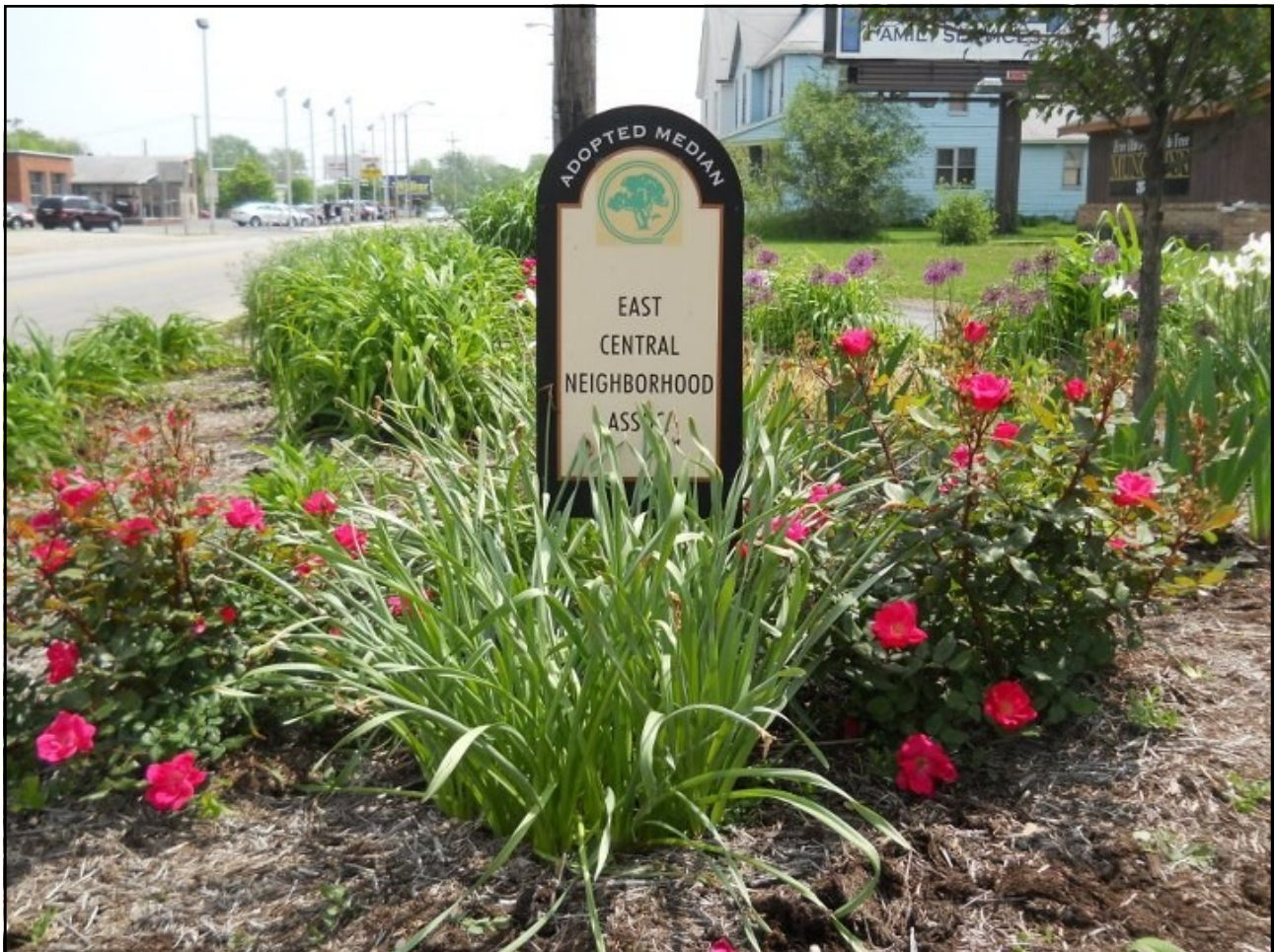
2010 Oscar Award Recipient East Central Neighborhood's "Adopt-a-Median"

Wednesday, Feb. 13th @ 6:30pm Minnetrista Cultural Center